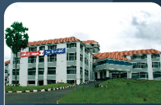
AHALIA SCHOOL OF OPTOMETRY