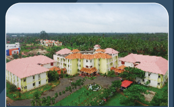
AHALIA SCHOOL OF ENGINEERING & TECHNOLOGY