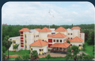
AHALIA SCHOOL OF MANAGEMENT