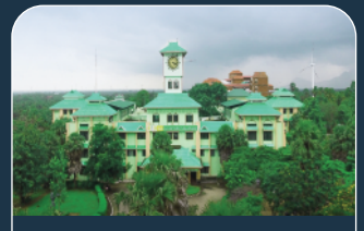
AHALIA AYURVEDA MEDICAL COLLEGE HOSPITAL