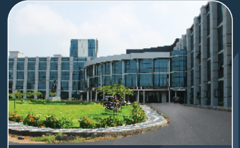
AHALIA SCHOOL OF PARAMEDICAL SCIENCES