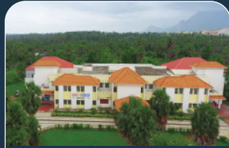
AHALIA SCHOOL OF PHARMACY