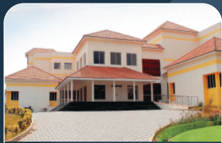
AHALIA SCHOOL OF COMMERCE & MATHEMATICS